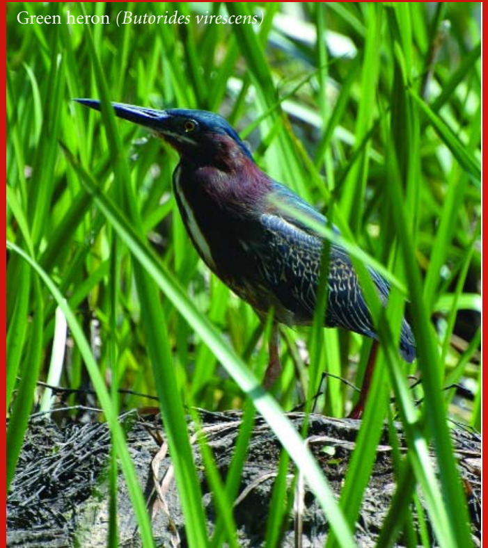
Green heron ( Butorides virescens )